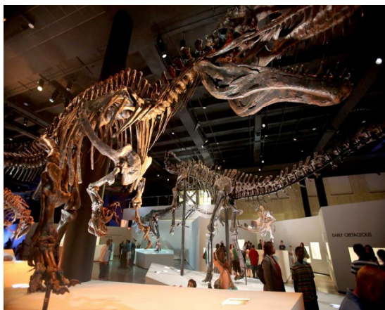
The Houston Museum of Natural Science